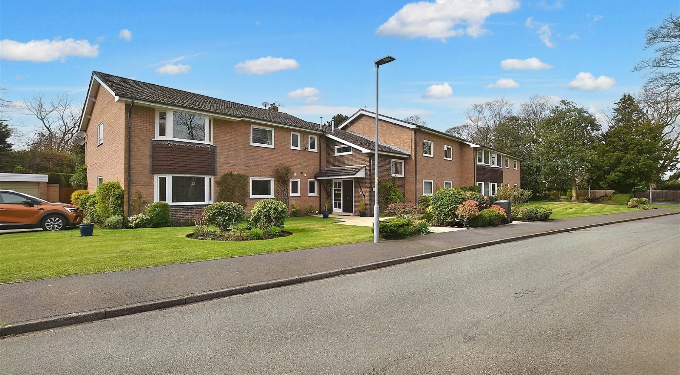
Ashley Court, Field Lane, Appleton, Warrington